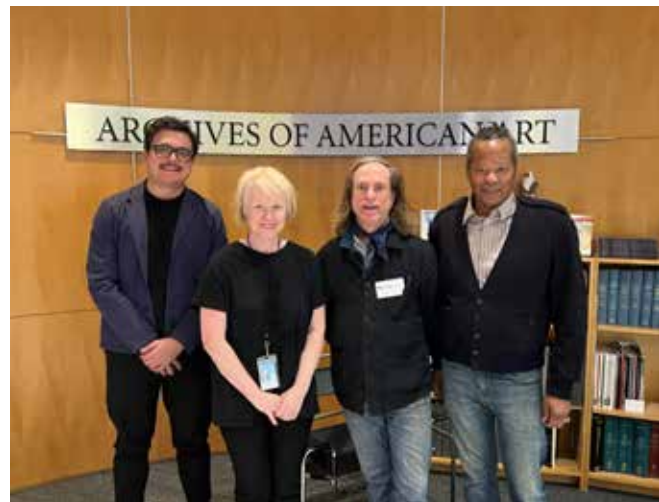
PMC and JW with Smithsonian staff in DC January 2023

Your support will help further our archiving projects including continuing film preservation and video digitization of over 40 years of radical activity.