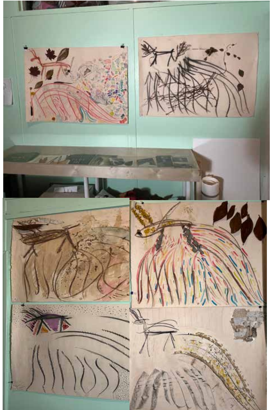
Six of the eight in the series of "Cave Drawings" by Davi Cohen and Jack Waters

"Development - Pestilence Part 2" is currently ...in development.