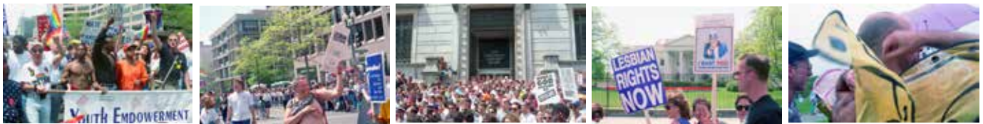
The March on Washington for Lesbian, Gay, and Bi Equal Rights and Liberation 1993