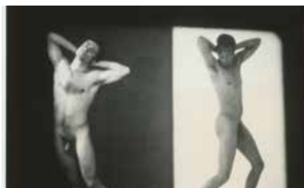
Still from Black & White Study Film by Peter Cramer 1990